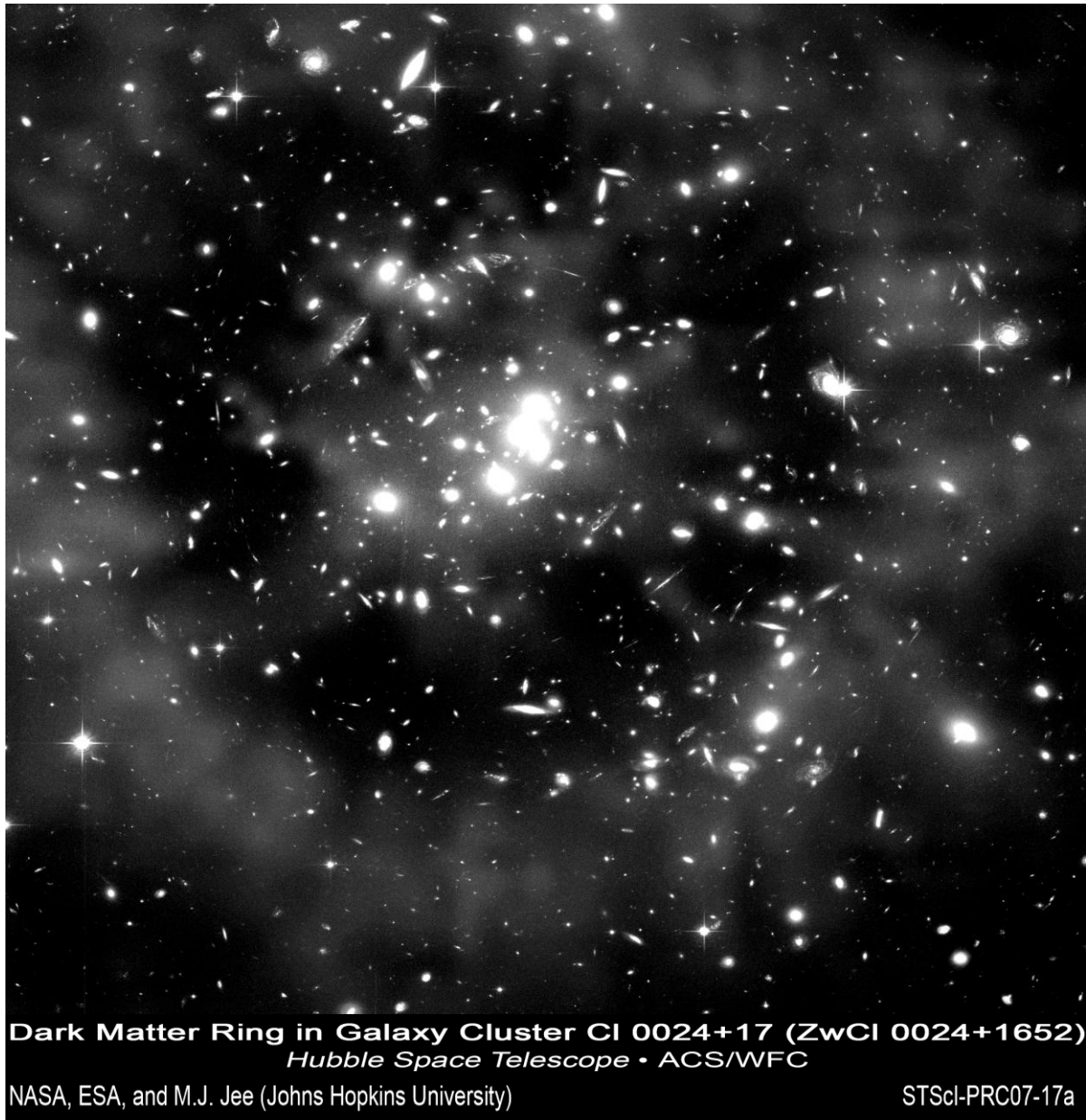
Dark Matter Ring in Galaxy Cluster Cl 0024+17 (ZwCl 0024+1652) Hubble Space Telescope • ACS/WFC